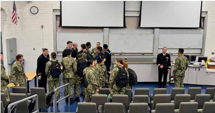
Sailors from the USS Tucson (SSN 770) conduct a city namesake visit with Midshipmen at the University of Arizona NROTC and the Sailors at Navy Reserve Center Tucson.