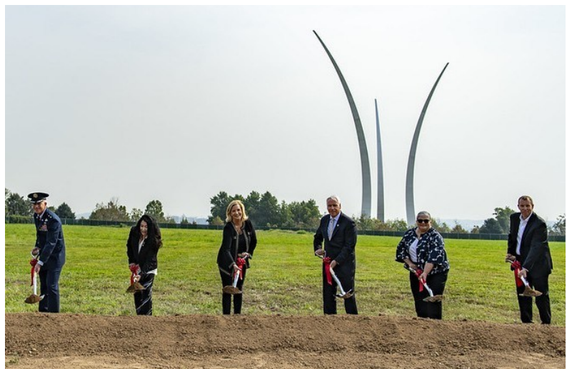
Senior leaders from ANC/OAC, the Army, FHWA, USACE, the Air Force District of Washington and contracting firm Kokosing during the DAR and Southern Expansion groundbreaking ceremony.

The three-phase project began construction in September 2021 and is scheduled to be completed in 2028. Phase I, scheduled for completion in 2026, realigns Columbia Pike, modifies the S. Joyce Street intersection and the Columbia Pike/Washington Boulevard (Route 27) interchange, and replaces Southgate Road with a new segment of S. Nash Street. Construction of Phase II and Phase III of the Southern Expansion project is anticipated to occur over the next five years (spring 2023 through winter 2027) and will add more than 80,000 new internment opportunities.